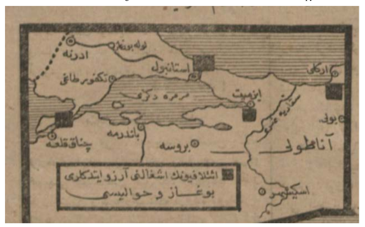
Vakit, 1 Teşrin-i sâni 1334 [1 November 1918], 1.