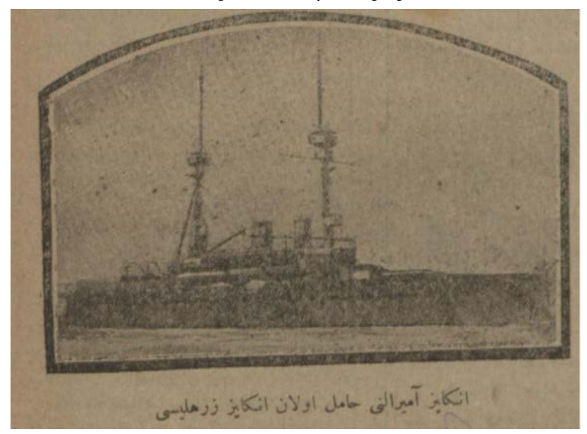
APPENDIX 5: English Armored Ship Including English Admiral