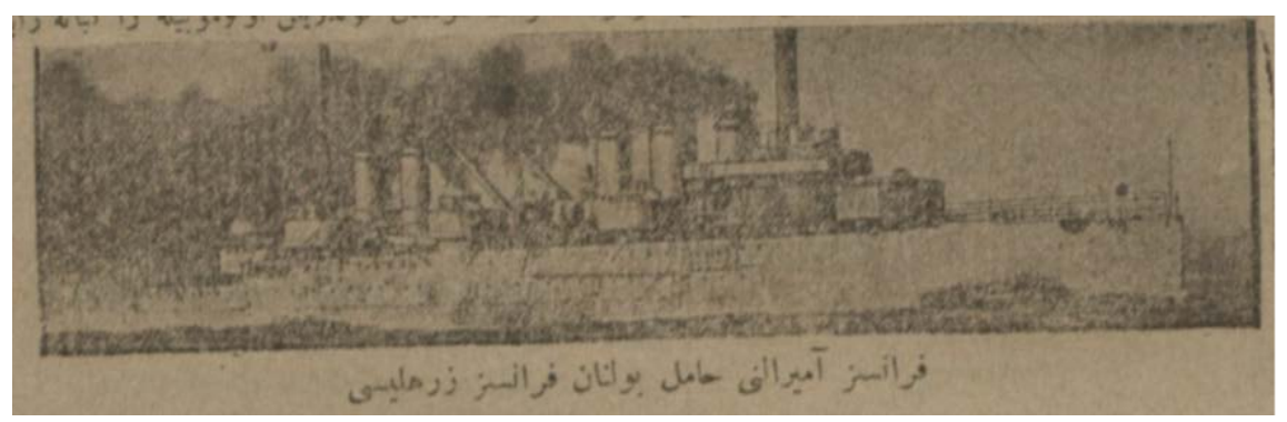
Vakit, 14 Teşrin-i sâni 1334 [14 November 1918], 1.