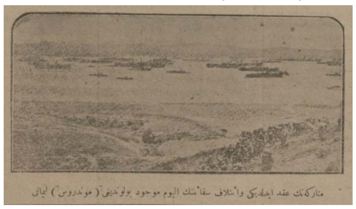
Vakit, 6 Teşrin-i sâni 1334 [6 November 1918], 1.